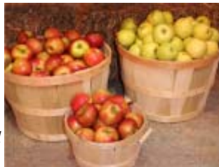
USApple secured apples for The Martha Show, in addition to supplying ideas for the apple-themed show.