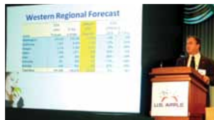
Dan Kelly of the Washington Growers Clearinghouse provides the pivotal 2009 apple crop forecast for the western region.