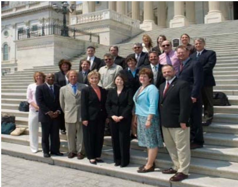
The New York agriculture industry meets with Senator Clinton on Capitol Hill during the fly-in on May 16.